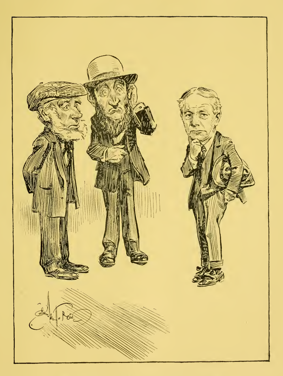
INTRODUCING A JOKE TO OUR BRITISH COUSINS